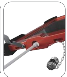
Stainless steel IO port with a secure latch