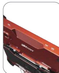
Seamlessly integrated buttons