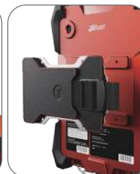
VESA 75 Mounting Compatibility