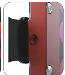
1/4-inch universal mounting

Compliant for ENVIRONMENTAL and SAFETY standards