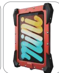
Pressure-resistant Glass screen protector