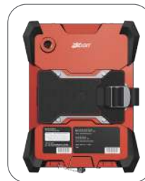
Premium aluminum alloy